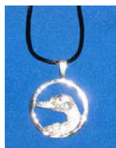
Hand Crafted Goose Head Pendant $32