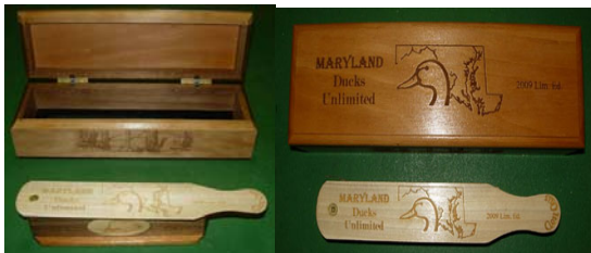
Turkey Call in MD presentation box. $70