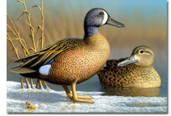
08/09 Maryland State Duck Stamp Print $60