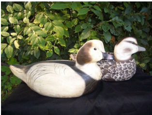
M Veasey Old Squaw pair $80

2009/10 Maryland Duck Stamp print by Wally Makuchal, Jr.. Bluewing Teal pair print with an inset of a mint condition 2009-10 MD duck stamp. $60