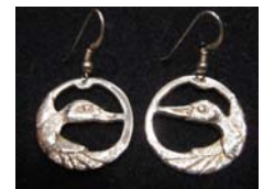
Ear Ring Set $23