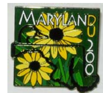
State Lapel Pin $1.00