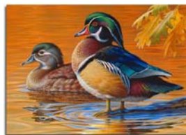
2007-08 MD Duck Stamp print $60 (only a few available)