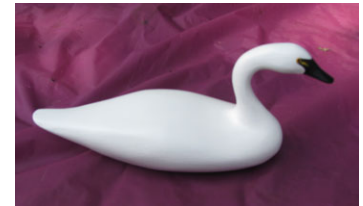
Casey Jobes Mini Swan $20

Miniature Swan carved by Casey Jobes $20