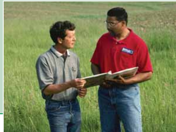
NRCS District Conservationist discussing conservation practices with landowner and SWCD Commissioner.